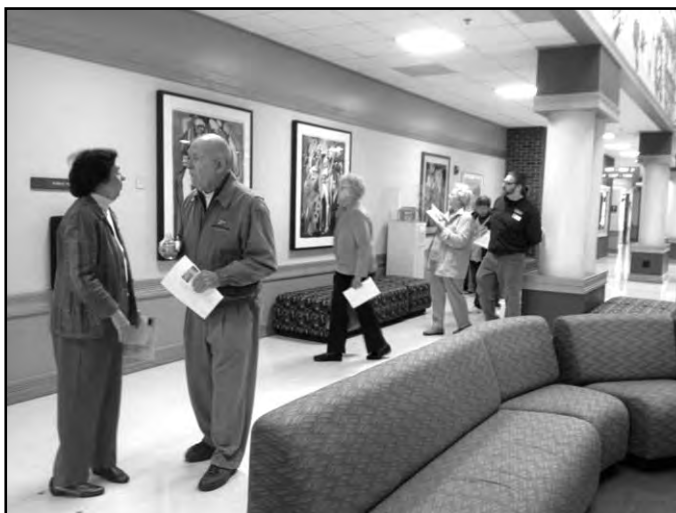
A group of retirees in May took a look at artworks on display at Ivy Tech Lafayette in an activity of the Campus and Community Activities Committee. The gallery is in Griffin Hall and contains works in a variety of media.

If you plan on attending, please fill out reservation form below.