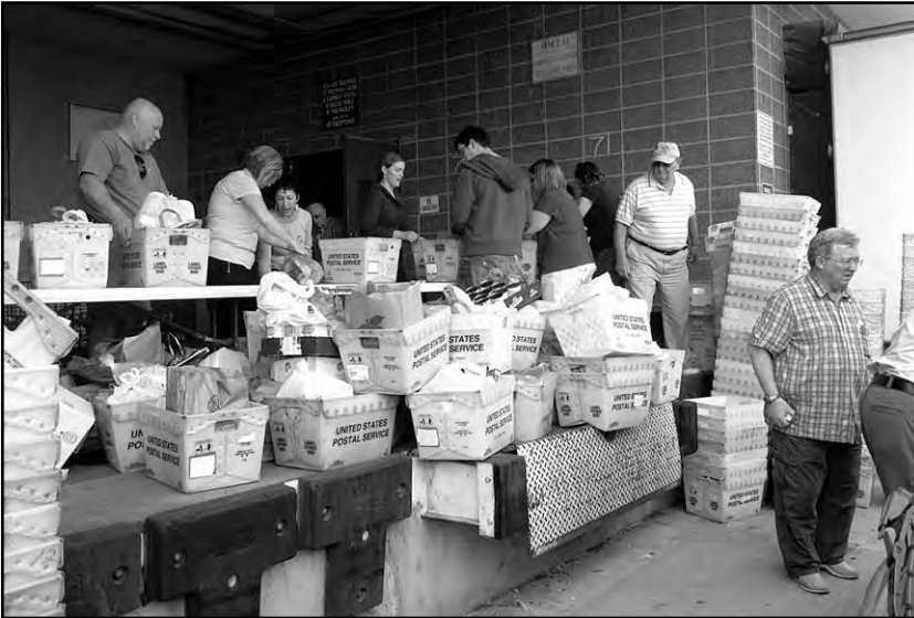
THIS PHOTO HAD NO DETAILS OF WHO, WHAT, WHEN WHERE, ETC. SO IT'S HARD TO DESCRIBE IT, BUT THE FILE NAME OF THE IMAGE SAID IT'S ABOUT FOOD FINDERS SO HERE IT IS.